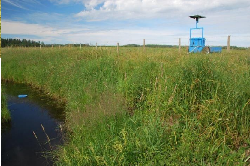
Riparian fencing-Washout Creek and watering systems