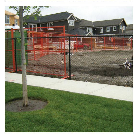
TOP: Perimeter control: Filter log with stakes.

MIDDLE: Covered soil stockpile with filter log at edge of stockpile to prevent sediment migration.